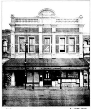
There by THE NEW FREMANTLE OFFICES OF THE -WEST AUSTRALIAN AND -WESTERN MAIL." IN MARKET STREET ON Page 30.

Photo taken from near the bottom of Windsor Street, Claremont of shops built on Claremont Crescent to the north side of the Perth-Fremantle railway (owned by Jessie Oldham in 1940 and thus possibly R.G. Oldham-designed), with Saladin Street houses visible behind the shops, and the Swanbourne Railway Station at right [called Congdon Street Station 1904-1911 and Osborne Station 1911-1921]. (Ian Oldham)